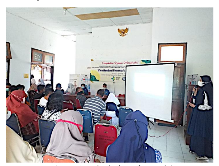
Figure 1. Submission of Materials

This training began with counseling on the benefits and content of hand sanitizers made from local plants, namely lime, mint leaves, and aloe vera , presented in figure 1. This is so that participants can find out how many benefits of using hand sanitizers whose ingredients can be obtained around us and can even be found in everyday life. The discussion about the benefits of hand sanitizers lasted quite a long time because people's curiosity was relatively high, including alternatives to using other plants that might also be used as essential ingredients for hand sanitizers. The next stage is the manufacture of hand sanitizer products.