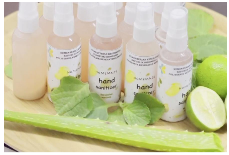
Figure 3. Sample Results of Community Service Activities Homemade Hand Sanitizer Products are non-alcoholic and non-toxic

After the series of product manufacturing is completed, participants can immediately feel the products that have been made so that this training is felt the benefits. At the time of the implementation, the community seemed very enthusiastic and immediately tried to make hand sanitizers with the materials and tools provided, the packaging of the activity results is as shown in figure 3. In addition, products that the community has made can be packaged in simple form and used at home and on the road. This is by the expected output, namely in the form of products that can be made reasonably cheaply.